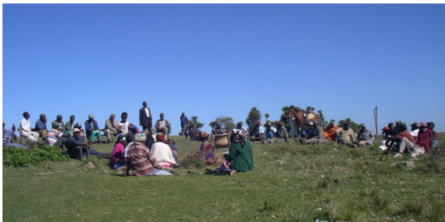
Fig. 1. Headman of Lwandile oversees a village meeting.

formally introduced to the Queen. We also accompanied the Headman's son on trips to Transcape NPO and to look for records at Municipal Archives and the Palace. We gathered data on formal performances, for instance at a school's official opening by provincial dignitaries and in events that arose because we were there. For example, we introduced the new NPO to The National Archives & Records Services, which led to hosting a 3.5-day workshop on Archives in Lwandile School, attended by over 50 villagers. The workshop was based on long oral presentations by the departments of Land Affairs and Environment; the House of Traditional Leaders; the Chief's emissary; and, the local Councillor. We observed media use locally and computer use at an Internet café in Mthatha, in a Coffee Bay tourist hostel and in Transcape's Education Centre. We also discussed villagers' media preferences and use in generating income and gathered data on phone handset models from the start of airtime sales in a spaza (local shop).