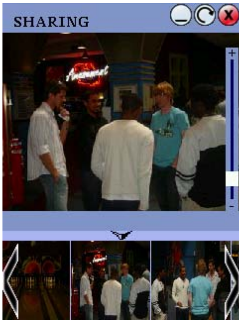
Figure 2: User viewing a shared photograph.