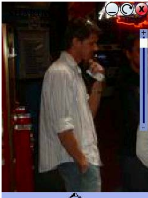
Figure 3: User using the zoom and move function to highlight a particular object in the shared photograph.