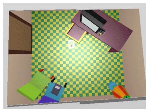
Figure 5. Pictures on the television set which shows users how to lay out the environment.