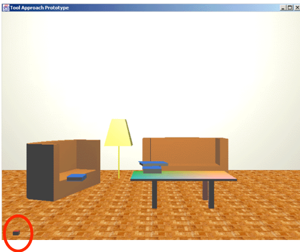
Figure 2 shows the toolbox, circled in the bottom left corner

Most virtual environments are quite similar to real life in this respect, and therefore we felt that using the toolbox idea in virtual environments is appropriate. To implement the idea, a toolbox is provided in the virtual environment as a 3D object that can be opened and closed. In real life, the toolbox is not seen until it is actively sought out. It is difficult to implement this in the virtual environment because objects outside the users' view frustum are difficult to access. Instead, we place the toolbox in a fixed location related to the user's viewpoint. Thus the users know where to find the toolbox when it is needed, and time is reduced in searching the entire virtual environment for the toolbox if it is located at a fixed position. Figure 2 shows the tool environment.