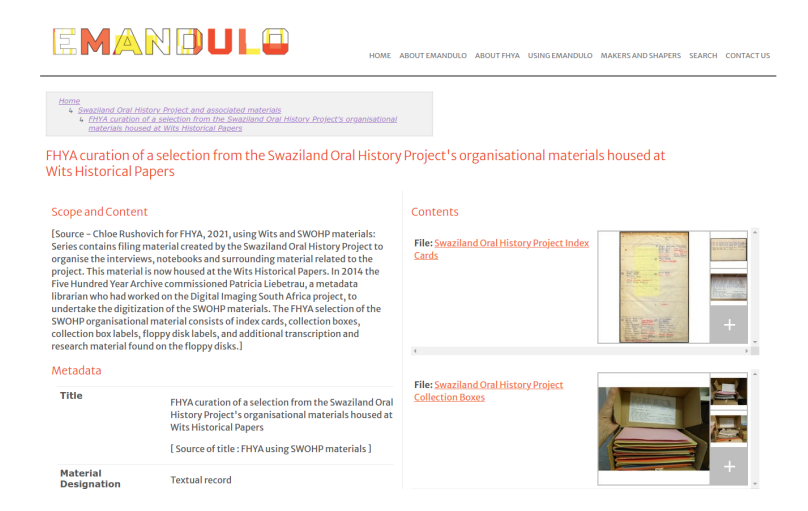
Fig. 2. Emandulo item listing