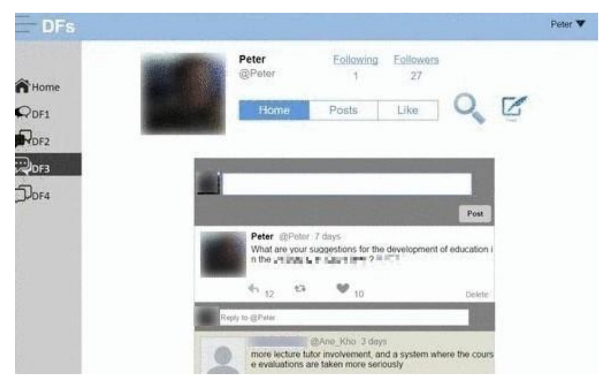
Figure 4: DF3 design