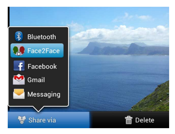
Figure 2. The Share Face2Face probe.

forded by current technologies don't support co-located interaction in a way that resonates with our earlier discussions. By building probes, left strategically incomplete and flexible, we engage with the more synthetic aspects of design, that "allows for a richer more situated understanding" [8, p.942] – not just in theory, but in practice by presenting users with real usage contexts [18]. In the following two sections we introduce these probes and how they express our understandings of design spaces we identified above.