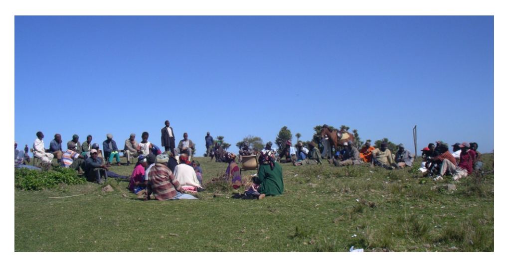
Fig. 1. Headman of Lwandile oversees a village meeting.

formally introduced to the Queen. We also accompanied the Headman's son on trips to Transcape NPO and to look for records at Municipal Archives and the Palace. We gathered data on formal performances, for instance at a school's official opening by provincial dignitaries and in events that arose because we were there. For example, we introduced the new NPO to The National Archives & Records Services, which led to hosting a 3.5-day workshop on Archives in Lwandile School, attended by over 50 villagers. The workshop was based on long oral presentations by the departments of Land Affairs and Environment; the House of Traditional Leaders; the Chief's emissary; and, the local Councillor. We observed media use locally and computer use at an Internet café in Mthatha, in a Coffee Bay tourist hostel and in Transcape's Education Centre. We also discussed villagers' media preferences and use in generating income and gathered data on phone handset models from the start of airtime sales in a spaza (local shop).