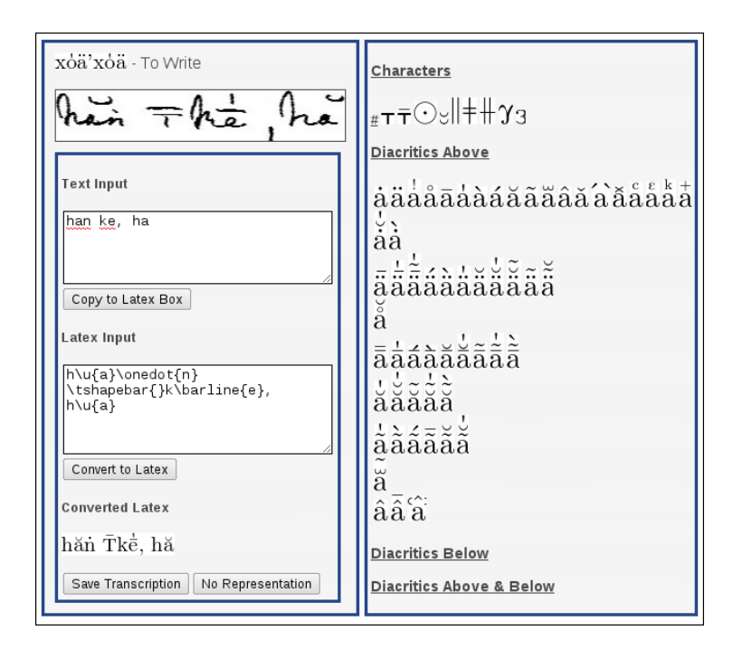
Fig. 3. Interface allowing user to capture the Bushman text