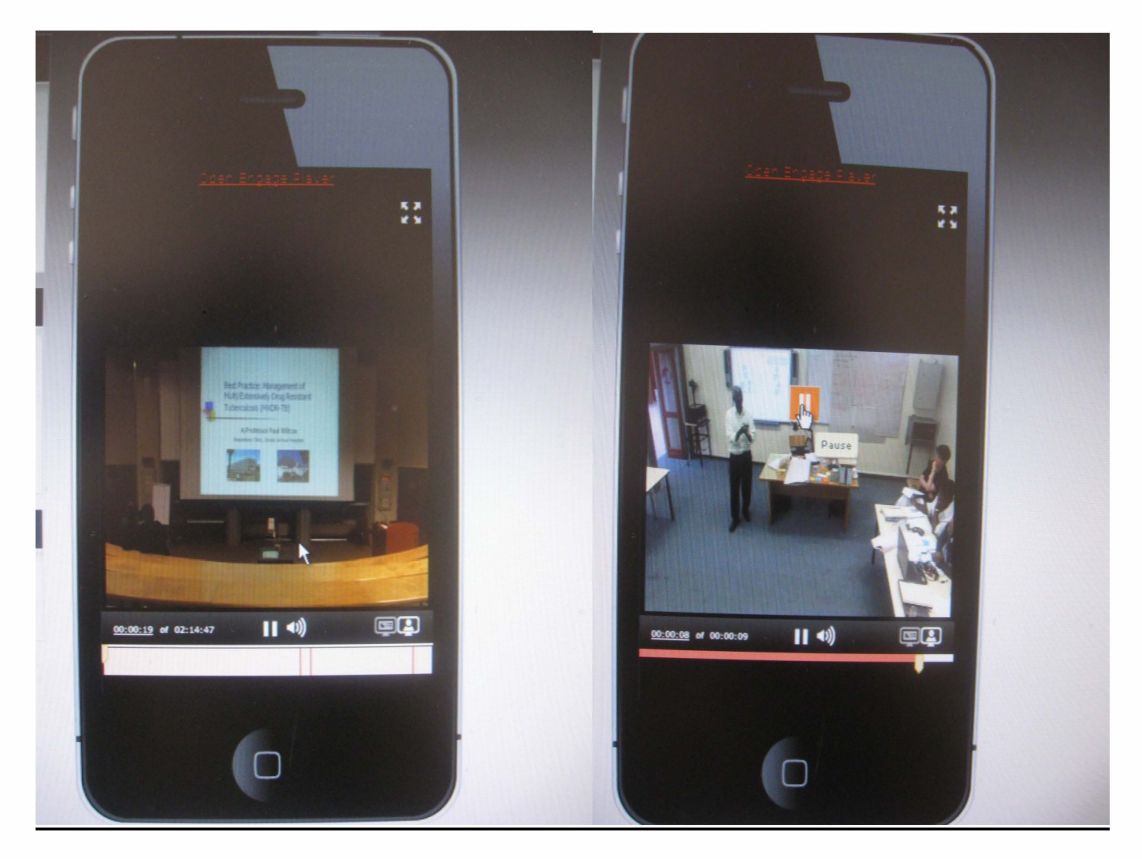
Figure 3. A Mobile User interface to Opencast