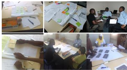
Figure 1. A few examples from our PD sessions

Three participatory design sessions were conducted on different days at UCT and MUK. Seven participants were selected among Computer Science and Information Systems lecturers at these universities. They were divided into three groups (one with three participants and the others with two each) in which the researcher acted as the facilitator for each group. Two participants who had initially volunteered to take part did not turn up hence the two groups with two members each. Figure 1 below shows an example from our PD sessions.