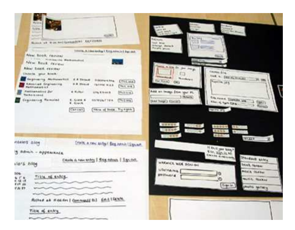
Fig. 2. Paper prototyping of system tool

The first stage of each iteration involved discussion of the overall design of the wizard, with paper sketches and Post-it notes to represent the system tool screens and interface elements. Participants could rearrange single elements freely (see Figure 2). The next stage of the study was to determine if the elements in each window were logically grouped or not. Participants were asked to click through each window and comment on positive and negative aspects. All users were satisfied with the outcome.