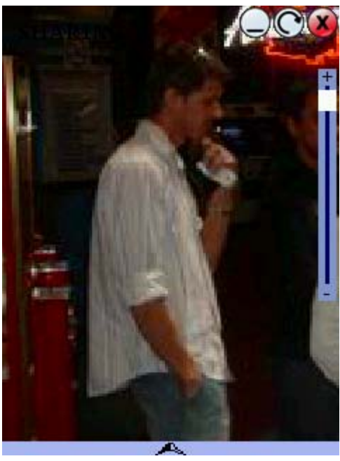
Figure 3: User using the zoom and move function to highlight a particular object in the shared photograph.