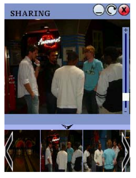
Figure 2: User viewing a shared photograph.