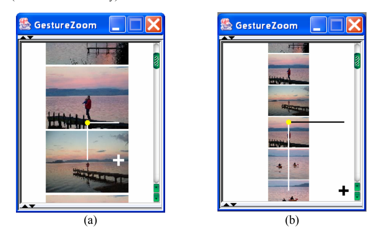
Fig. 2. GestureZoom interface: (a) moderate scroll speed and small image reduction; (b) maximum speed and minimum size. (Cross added for clarity)