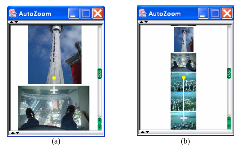
Fig. 1. AutoZoom interface: as cursor is dragged away from centre, scroll speed/image size change. (a) moderate speed, images slightly reduced; (b) faster speed and smaller size (Cross added for clarity)